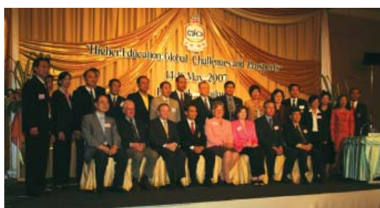
International Conference on Higher Education: Global Challenges and Prospects