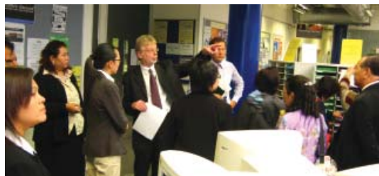
A Study Visit to the United Kingdom of Senior Staff from Universities in Thailand