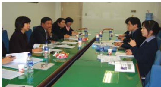
A Research Project on "A Study on Higher Education Innovation"