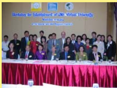
Group photo of all delegates and participants