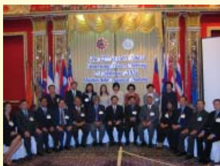
Group Photo of SEAMEO RIHED Governing Board Members and Participants