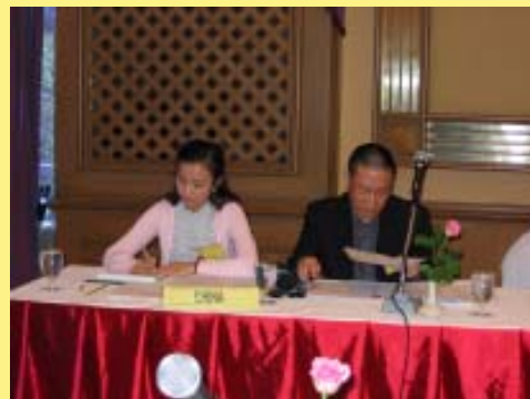
Participants from China