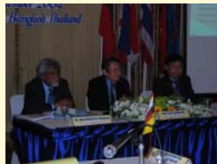
SEAMEO RIHED Director presents Annual Report

As the term of office of the present SEAMEO RIHED Director will be completed soon, the Board spent a final session deliberating on guidelines for selection of the Centre Director for the next term.