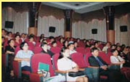
In the Meeting Room at Suan Dusit Rajabhat University.

During the course of the meeting, presentations on teacher education in various aspects of the two countries were made and followed by discussion on possible cooperation between PAFTE and TCDE. The two organizations agreed to work out on MOU and would continue cooperation and collaboration in these following areas: