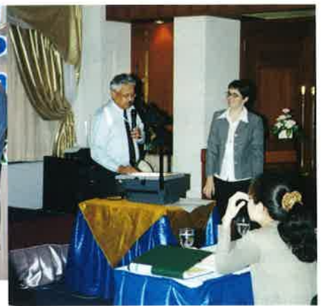
Participant giving presentation.