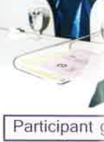
Participant engaged in a discussion.