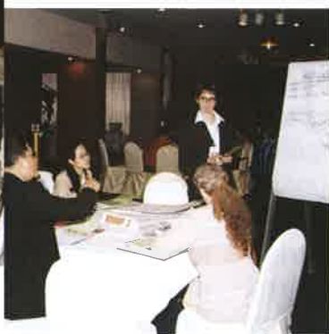
Group devising workplan.

A solicited or competitive bidding proposal on the other hand, is where more than one organisation is sought to bid on a service or function. In this type of proposal, organisations respond to funding agencies tendered