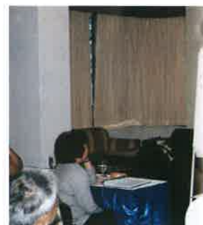
Participants working at a table.