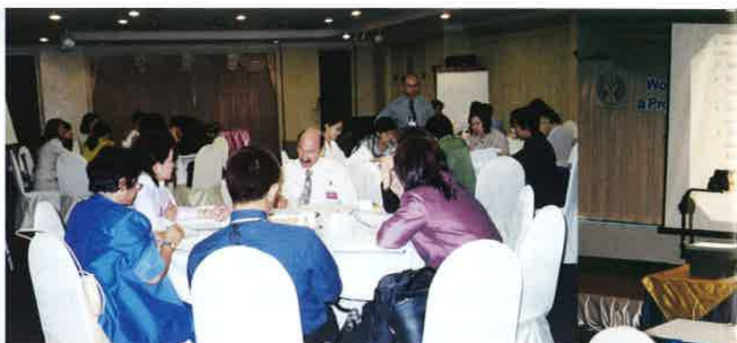
Group discussing workplan.