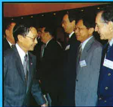
International Conference on Quality Assurance in Higher Education ....p.3