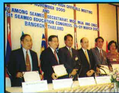
1st SEAMEO Education Congress 26-29 March 2001- Bangkok.....p.2