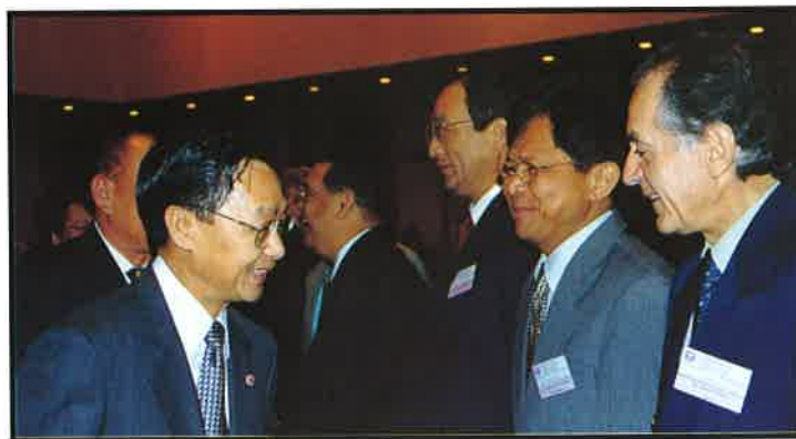
Former Prime Minister, Chuan Leekpai greeting participants

of this to be accomplished collaborative efforts at both the regional and international level are required. In his closing remarks, he stated that this International Conference is an important step in this direction. Besides reflecting our commitment to achieve a better education system, this meeting has provided a valuable opportunity to exchange views and experiences to promote quality assurance in Southeast Asian countries.