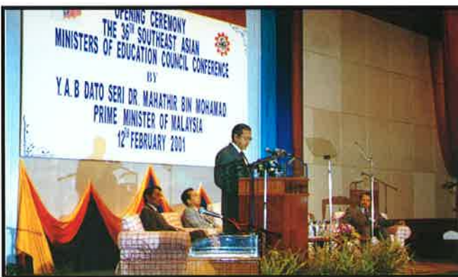
Keynote Address by Prime Minister of Malaysia, H.E. Dr. Mahathir bin Mohamad at the 36th Southeast Asian Ministers of Education Council Conference.