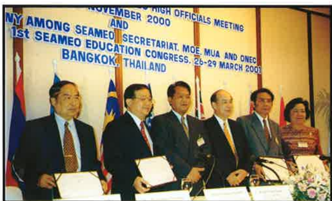
Signing of agreement among partners in organising 1st SEAMEO Education Congress, 26 - 29 March 2001 - Bangkok, Thailand